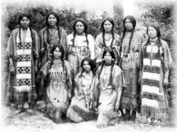
Fort Shaw Industrial Indian Boarding School operated between 1891 and 1910 when it closed due to declining enrollment. Ft Shaw, MT